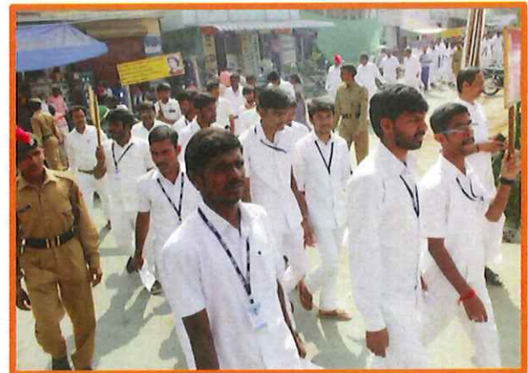
Participation of Student Teachers and Faculty Members in the Rally