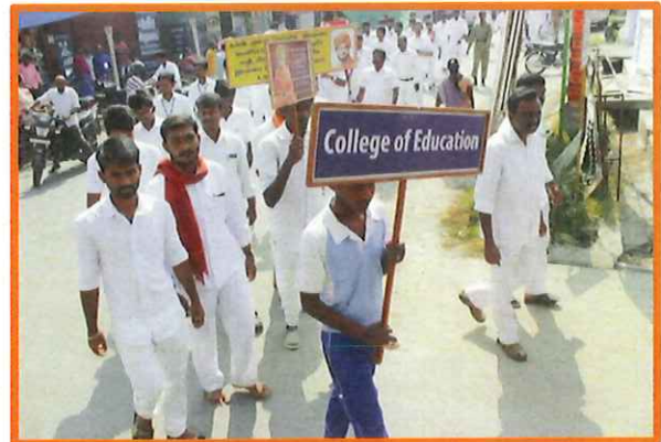
Participation of Student Teachers and Faculty Members in the Rally