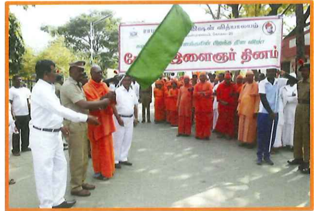
Flagged off the Rally by Chief Guests