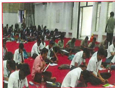
During the Competition