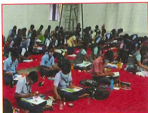
Competition Day 2 - 16.11.2018