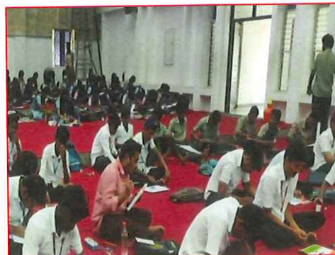
During the Competition