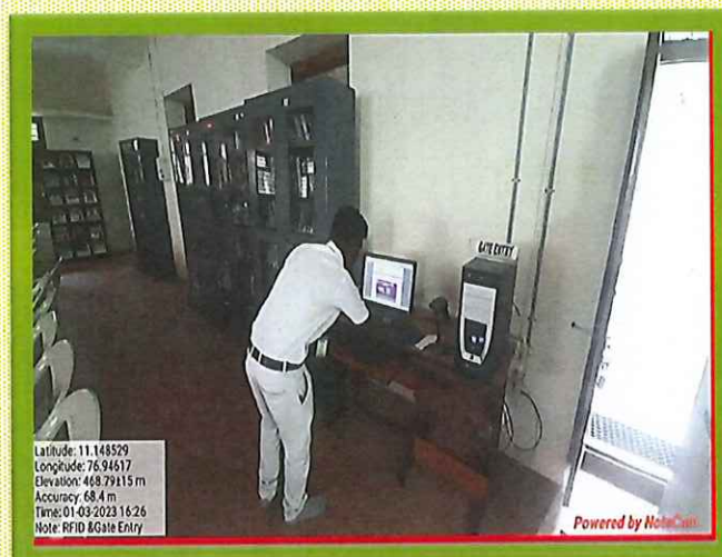
RFID & Gate Entry