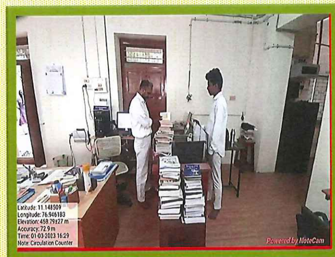
Book Transaction Counter