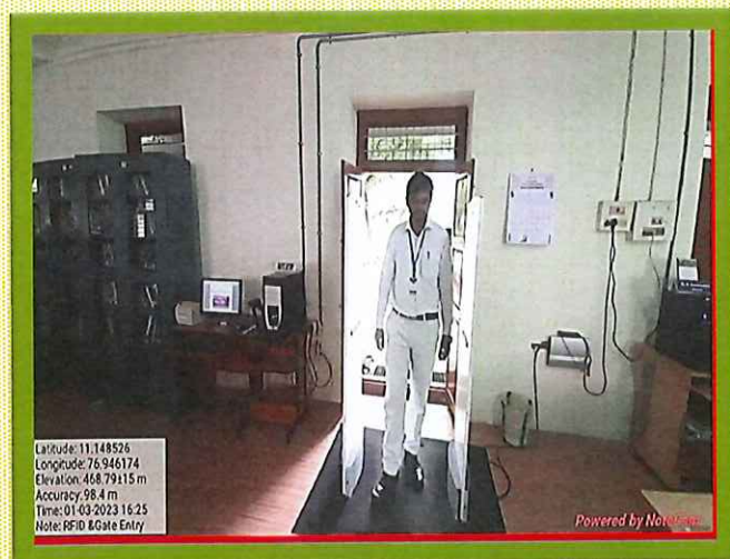
RFID & Gate Entry