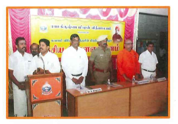
Inauguration of the Programme -Prayer