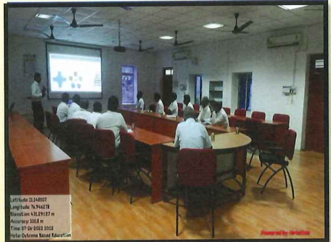
OBE - Explanation